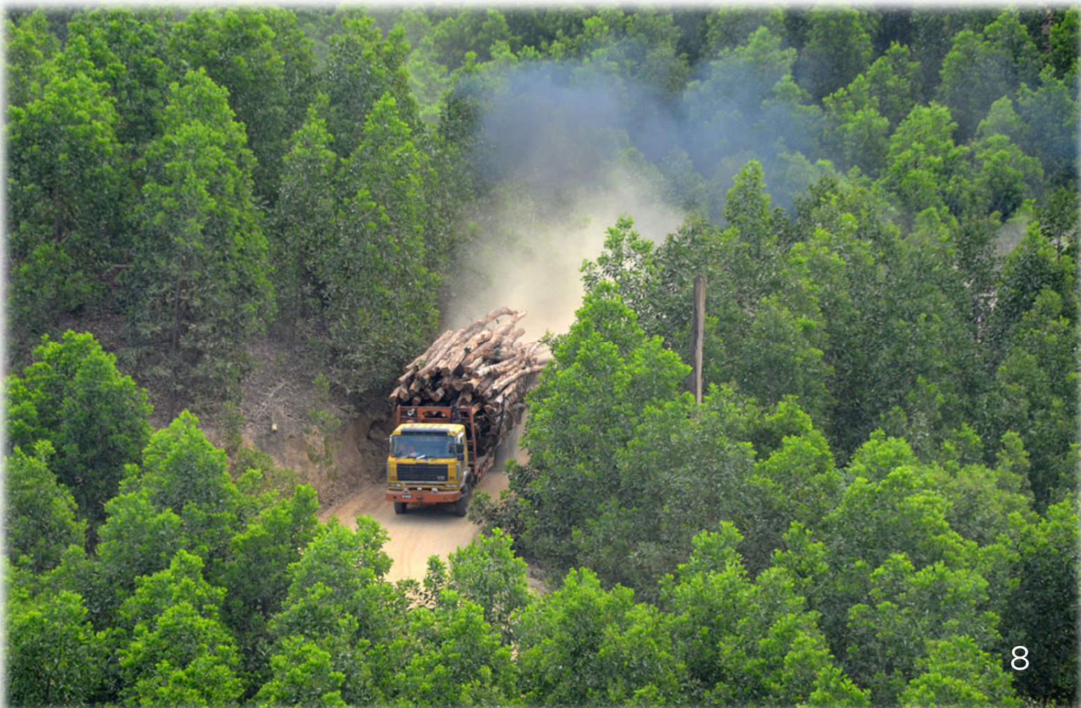
Truck at Hijauan Bengkoka Plantations transports acacia logs to the log yard

New Forests continues to manage the Malua Biobank, a 34,000 hectare conservation investment in Sabah, Malaysia. The project began in a former logging concession in 2008 and operates under a Conservation Management Plan. The forest shows positive signs of regeneration and well-structured natural forest rehabilitation. Regular monitoring activities have also shown a reduction in illegal activities such as poaching throughout the reporting period. At the same time, wildlife sightings are on the rise, particularly for species that are sensitive to hunting and disturbance. New Forests is proud of these achievements and continues to advocate for biodiversity compensation mechanisms that can support forest rehabilitation as demonstrated at Malua.