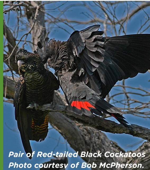
Pair of Red-tailed Black Cockatoos

The 2014 restoration activities are just the beginning. Property managers will monitor the nest boxes and continue to record red-tailed black cockatoo sightings as part of their ongoing wildlife monitoring. The effort will also continue at another New Forests plantation in 2015.