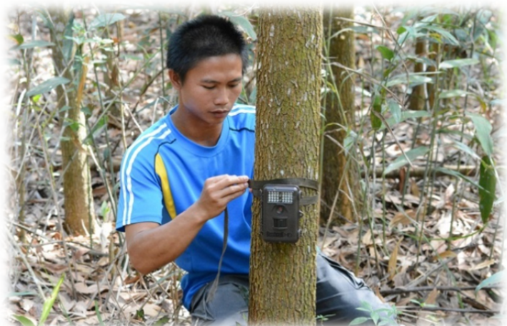
Securing a camera for wildlife monitoring at the Hijauan Bengkoka Plantations estate

As the camera trapping program continues, the Environment Team will seek to include the whole operational area. The camera traps provide a very efficient way to supplement wildlife surveys. For example, the camera traps will be used for monitoring of rare, threatened, and endangered species in HCV areas, including the natural forest area known as Wasoi in the concession.