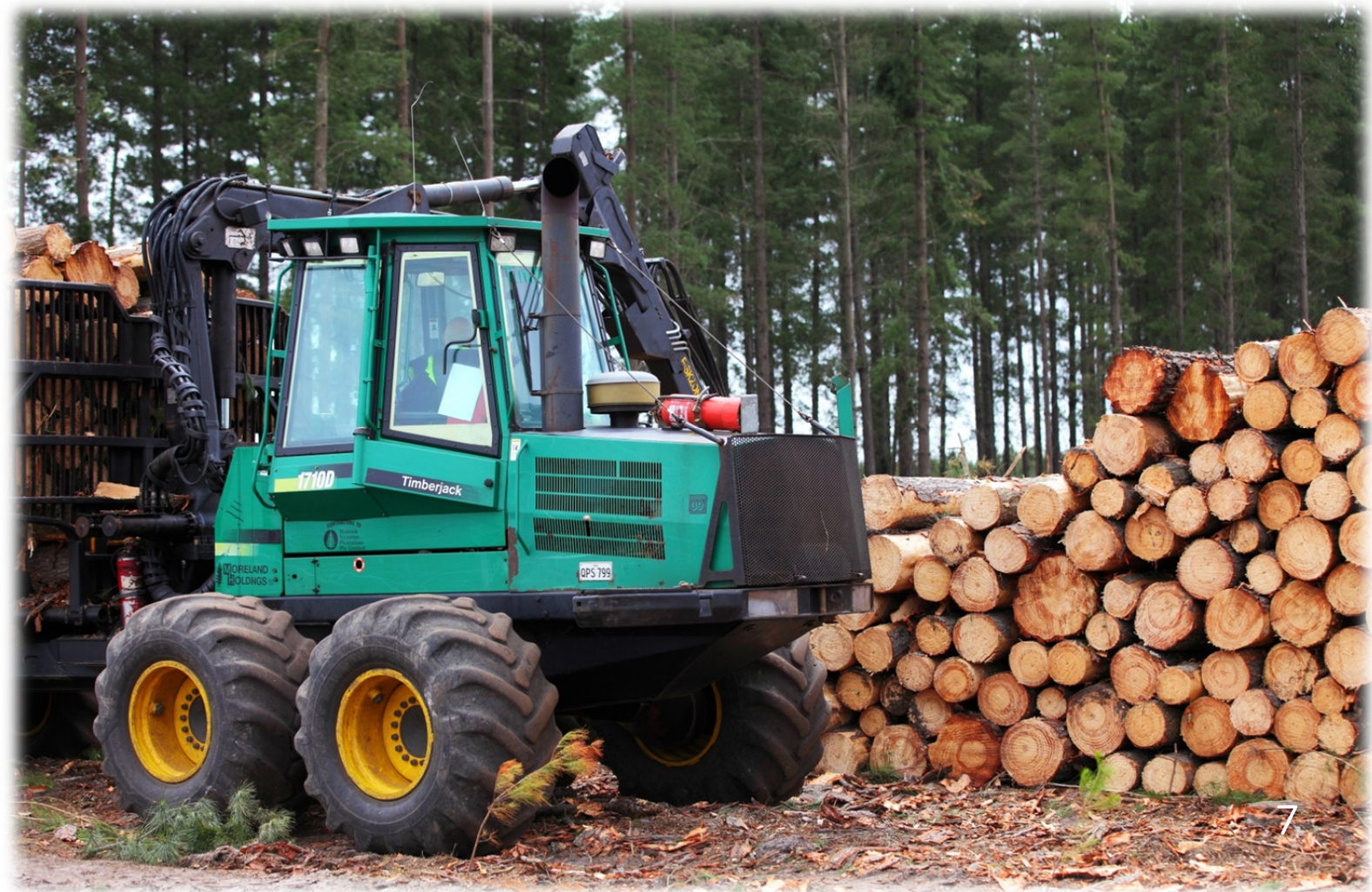
Log pile and forwarder at a harvest site in Penola Plantations

In February 2014 New Forests announced the final close of the Australia New Zealand Forest Fund 2 (ANZFF2) with AUD 707 million in committed capital. New Forests established and launched Forico Pty Ltd and manages a 175,000 hectare Tasmanian forestry estate purchased from the Receivers of Gunns Ltd in September 2014. This acquisition made New Forests the largest timberland investment manager in Australia.